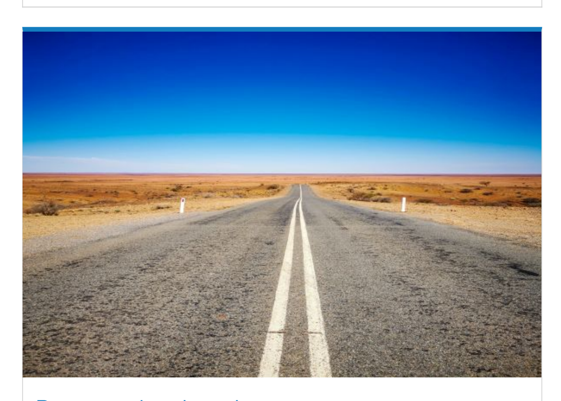
Remote work and travel