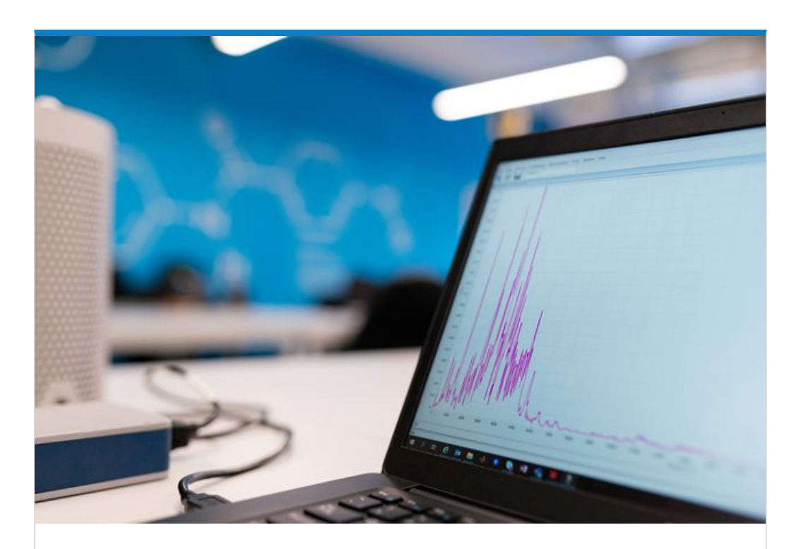
NT data at a glance