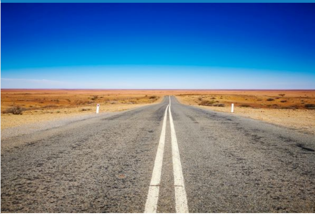
Remote work and travel