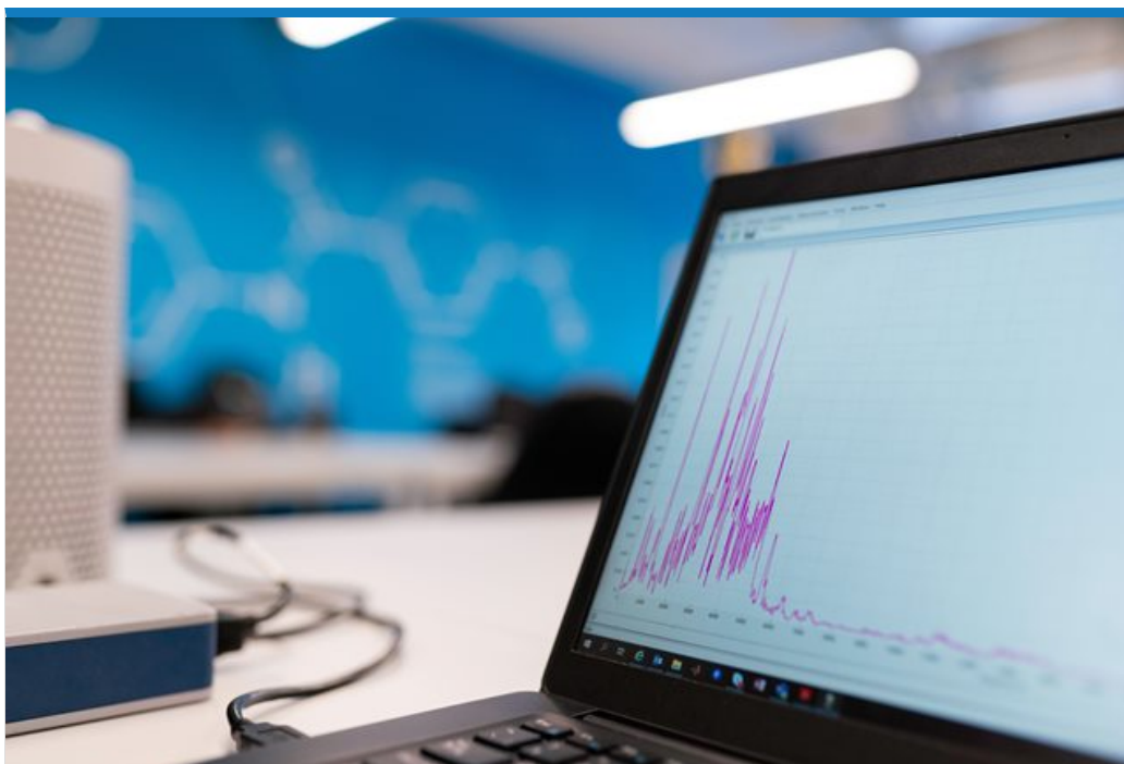
NT data at a glance