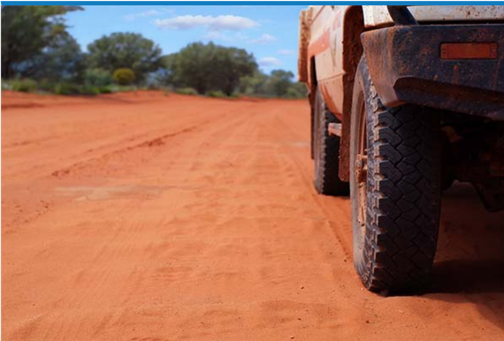
Remote work and travel