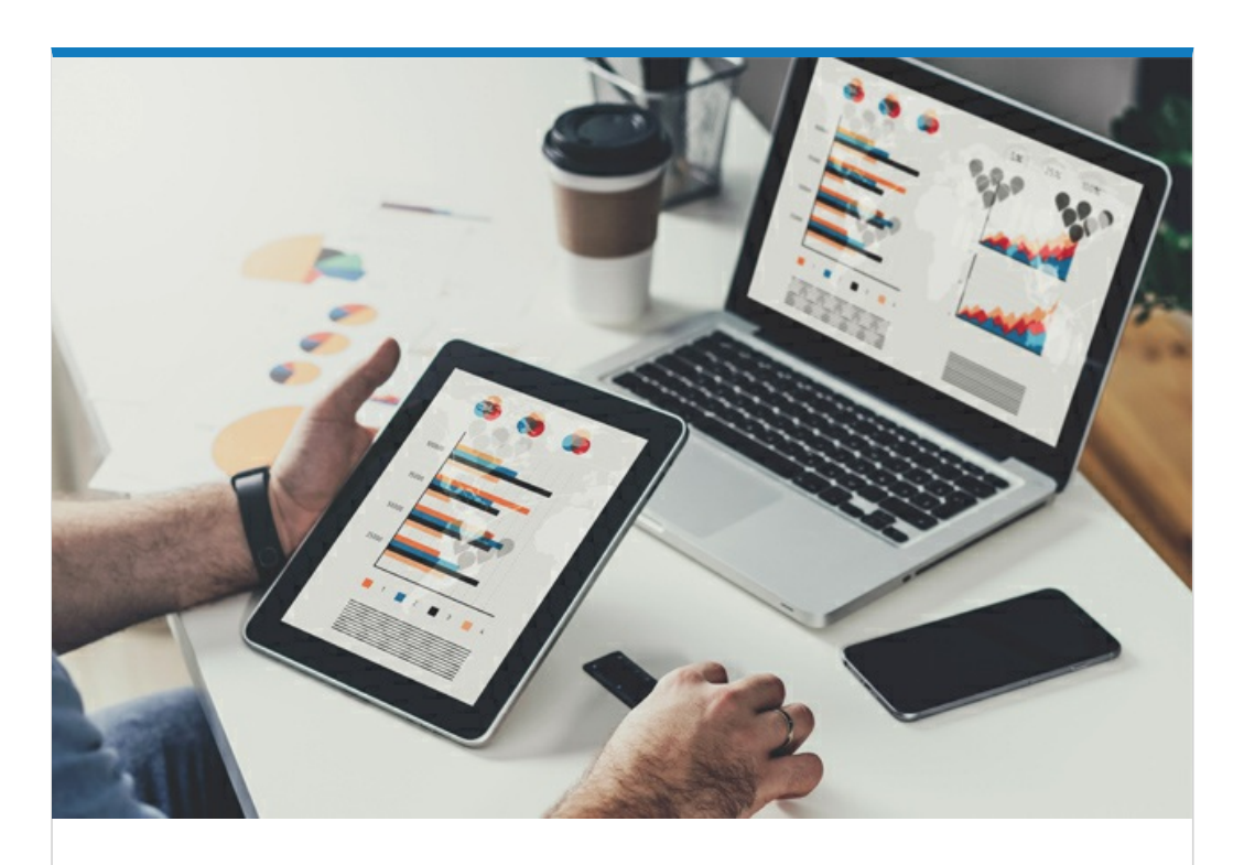
NT data at a glance