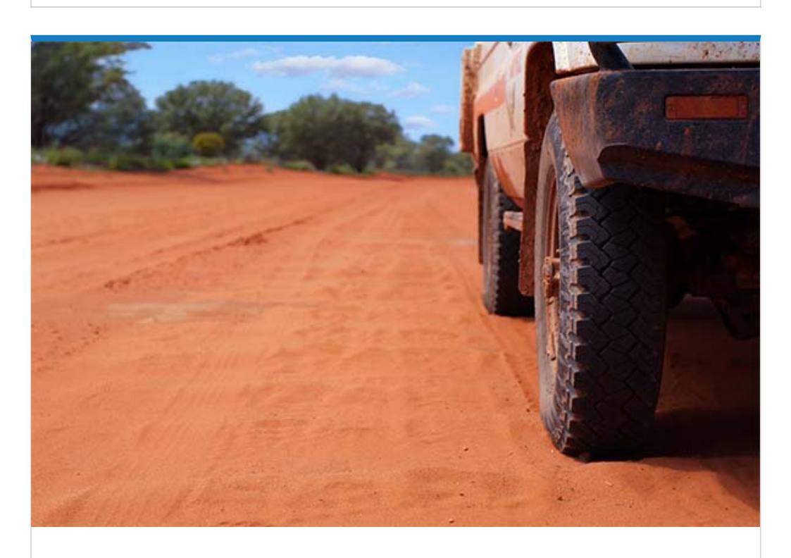
Remote work and travel