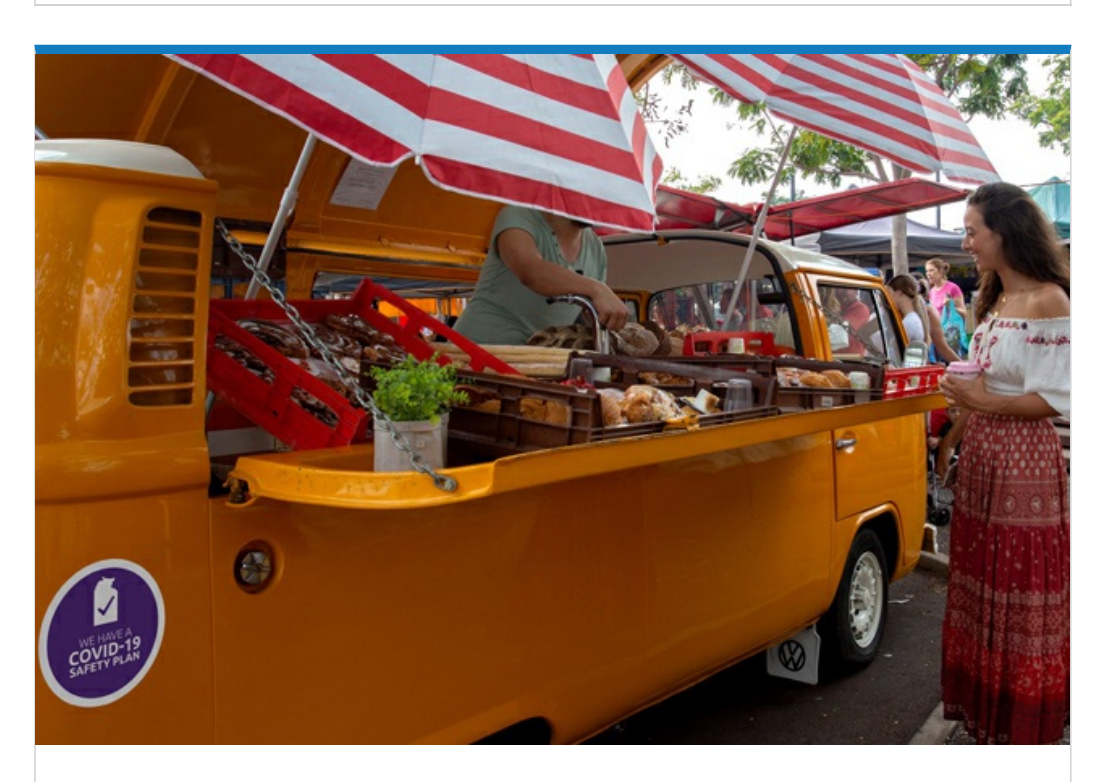
Roadmap to the New Normal