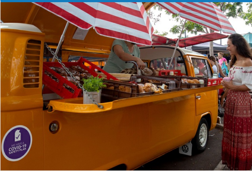
Roadmap to the New Normal