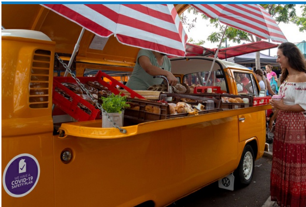
Roadmap to the New Normal