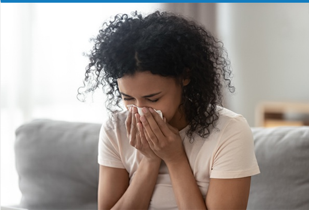
Safety, Symptoms and COVIDSafe App