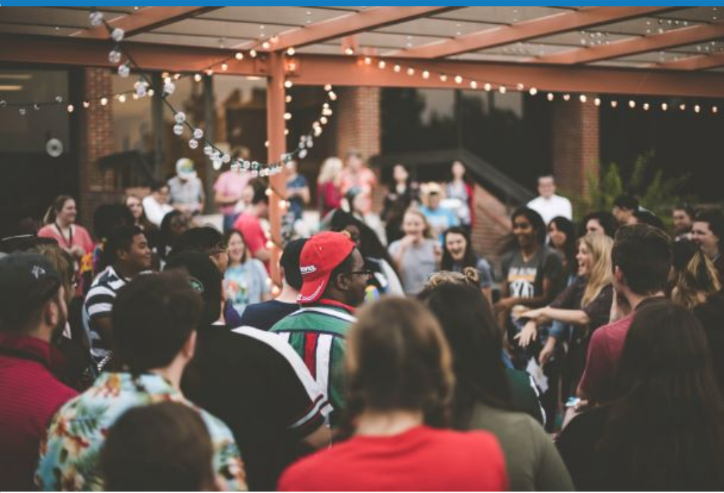
Events and gatherings