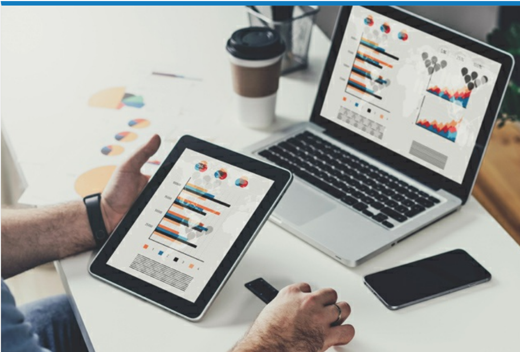
NT data at a glance