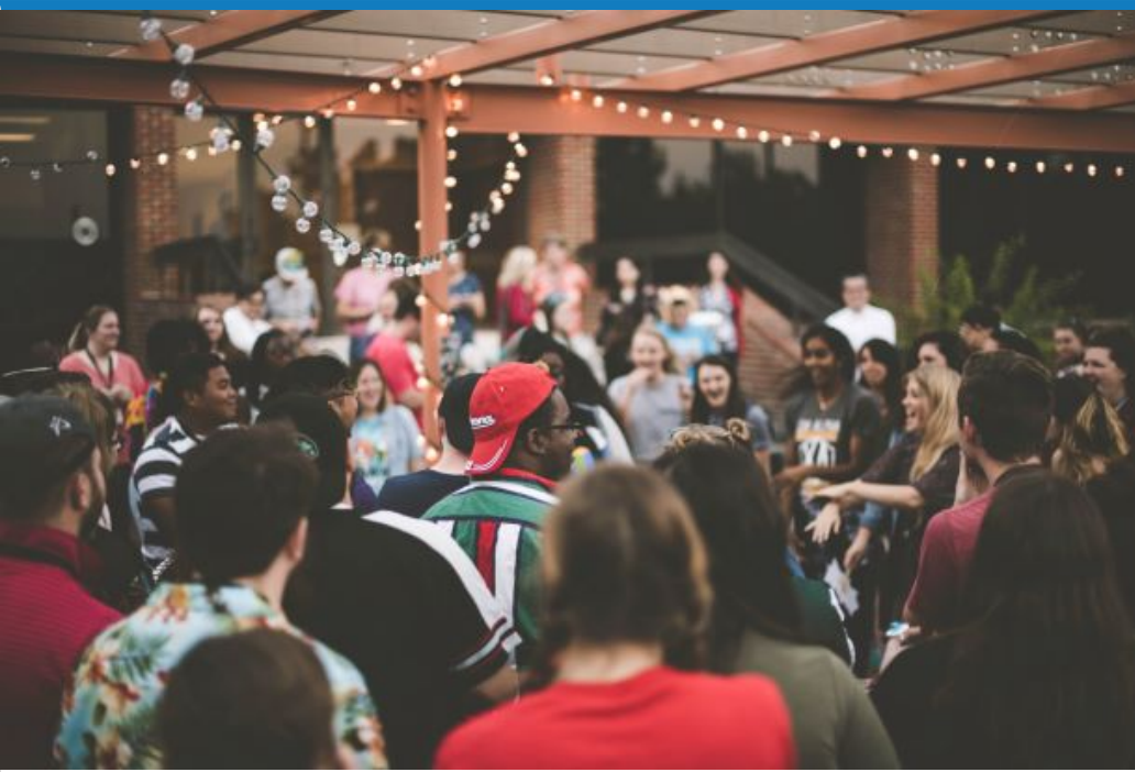
Events and gatherings