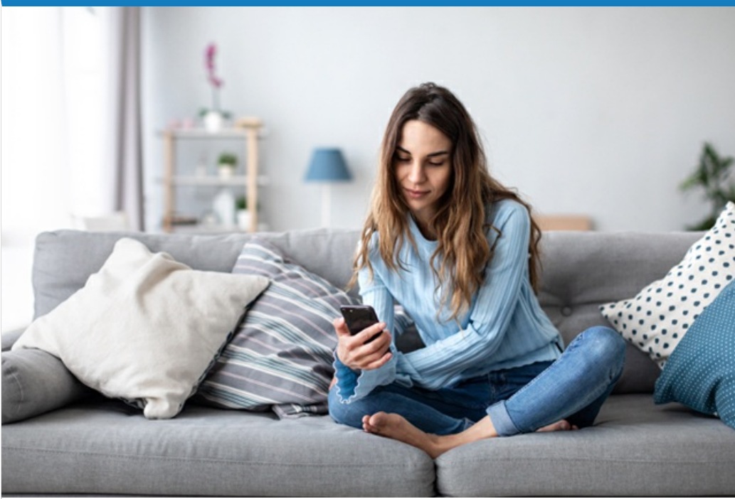
Border control and Mandatory self-quarantine