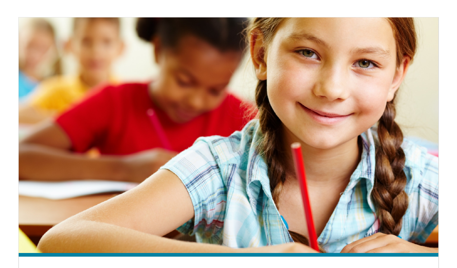
K to 12 school re-entry

Guidance and plans for students to start the 2020-21 school year.