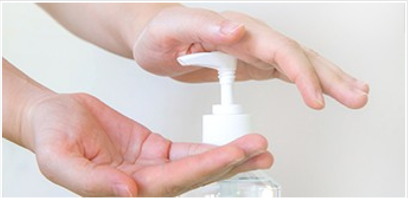
Protect Yourself and Others