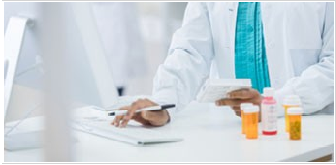
Health and Allied Health Professionals