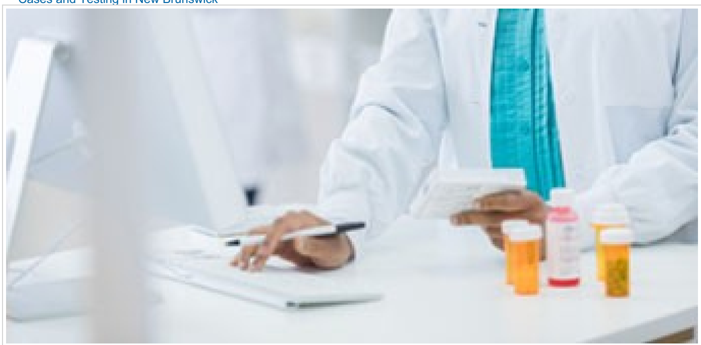
Health and Allied Health Professionals