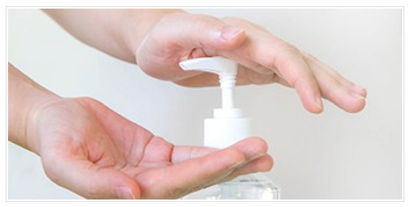
Protect Yourself and Others