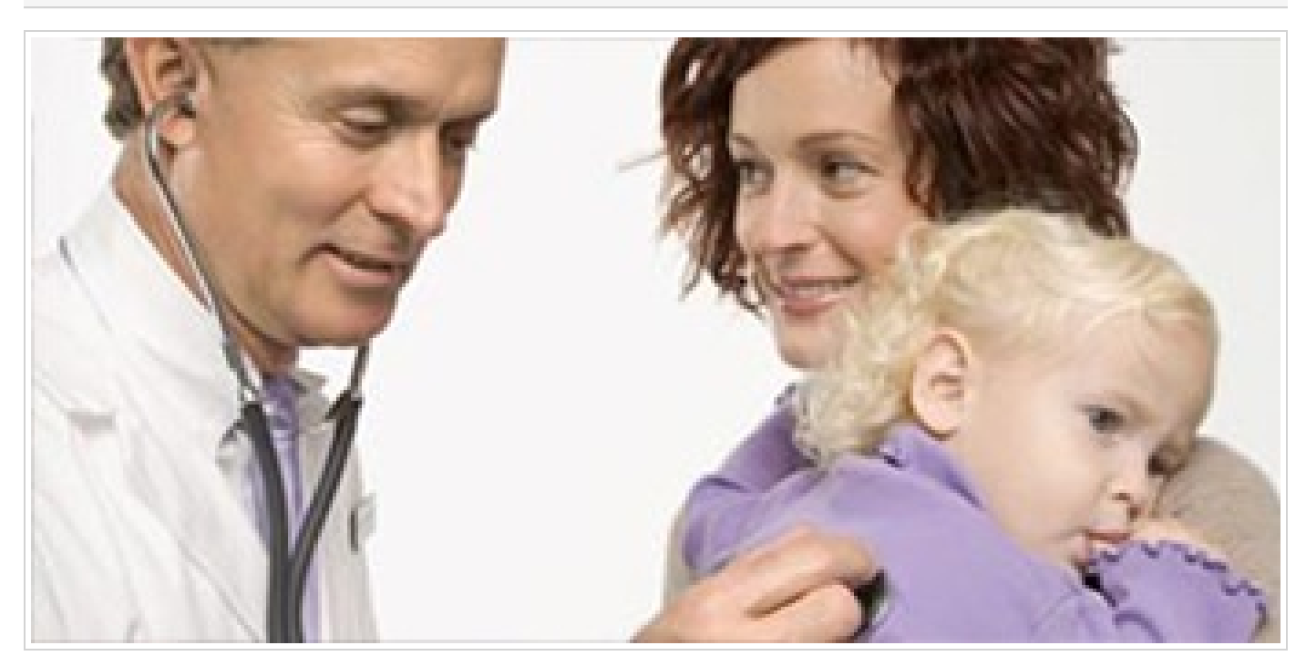
Patient Connect NB >

Prepared by the New Brunswick Chief Medical Officer of Health: Updated March 23, 2020