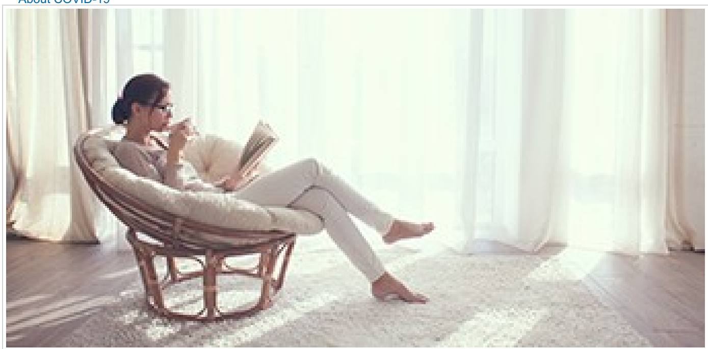
Self-monitor, self-isolate and isolate