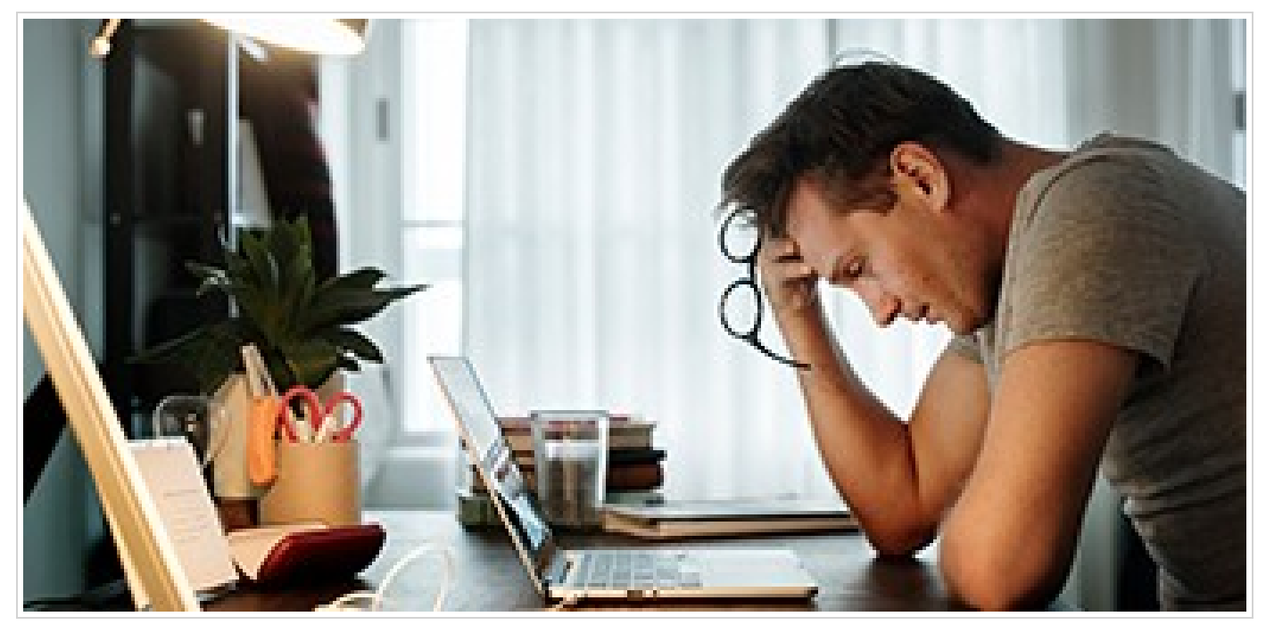
Mental Health and Coping During COVID-19