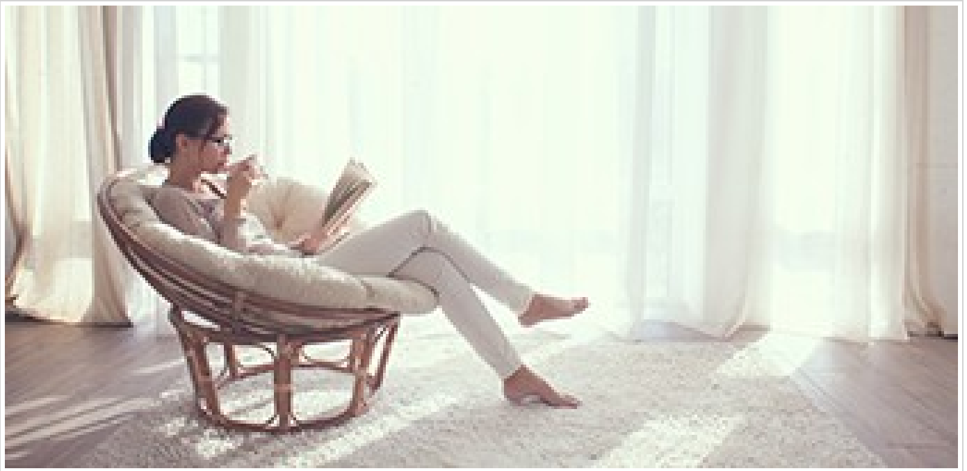
Self-monitor, self-isolate and isolate