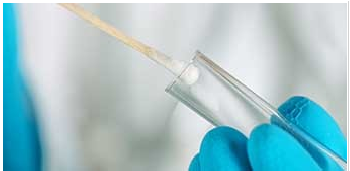
Cases and Testing in New Brunswick

As of March 23, 2020: Laboratory testing is done by the Dr. Georges-L.-Dumont University Hospital Centre