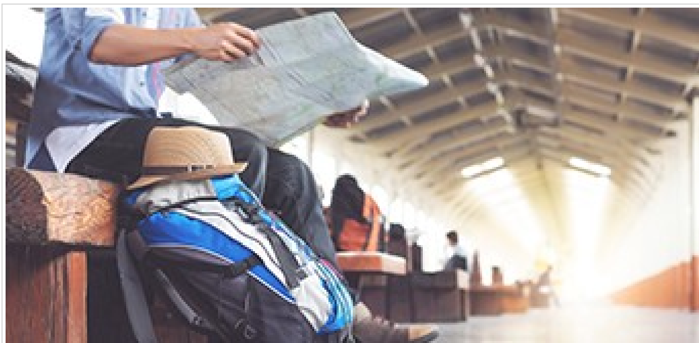
Information for Travellers