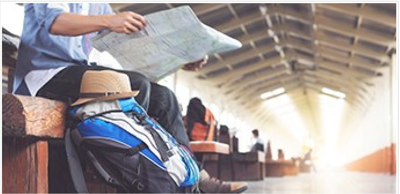
Information for Travellers