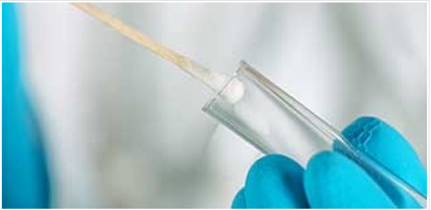
Cases and Testing in New Brunswick