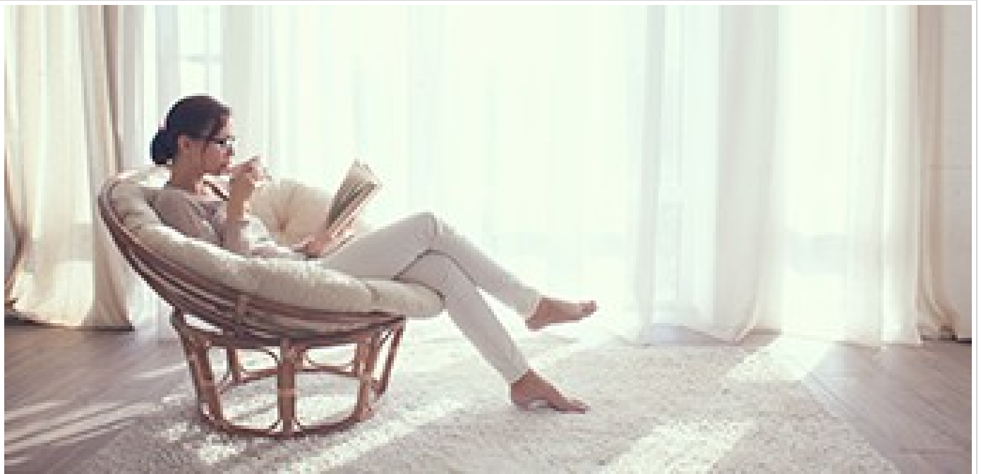
Self-monitor, self-isolate and isolate