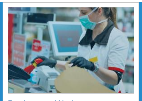
Business + Work

Information and resources for employers, employees, economic relief, essential and high-risk workers in the NWT.