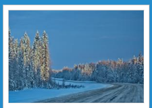
Travelling + Moving Around International and domestic travel, NWT border, self-isolation plans, parks, tourism operators, and long-haul

Mental and physical health, financial supports, travelling, parenting, caring for others, services and safety for individuals and families.