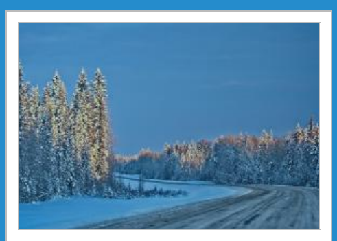
Travelling + Moving Around International and domestic travel, NWT border, self-isolation plans, parks, tourism operators, and long-haul

Mental and physical health, financial supports, travelling, parenting, caring for others, services and safety for individuals and families.