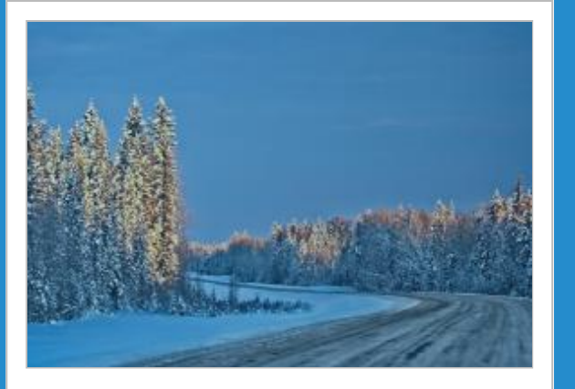
(https://www.gov.nt.ca/covid-19/en/services/travel-moving-around) Travelling + Moving Around (https://www.gov.nt.ca/covid-19/en/services/travel-moving-around) International and domestic travel, NWT border, self-isolation plans, parks, tourism operators, and long-haul trucking information.

Mental and physical health, financial supports, travelling, parenting, caring for others, services and safety for individuals and families.