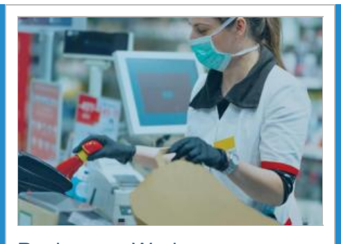
Business + Work Information and resources for employers, employees, economic relief, essential and high-risk workers in the NWT.