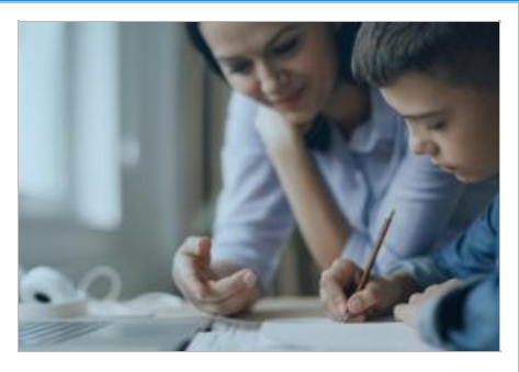
Child Care, School + Learning Early learning, child care, JK-12, and post-secondary information and resources for students, parents, caregivers and teachers.