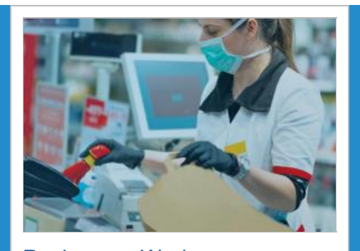
Business + Work Information and resources for employers, employees, economic relief, essential and high-risk workers