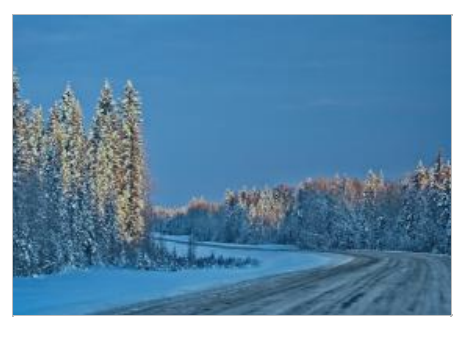
Travelling + Moving Around

Mental and physical health, financial supports, travelling, parenting, caring for others, services and safety for individuals and families.