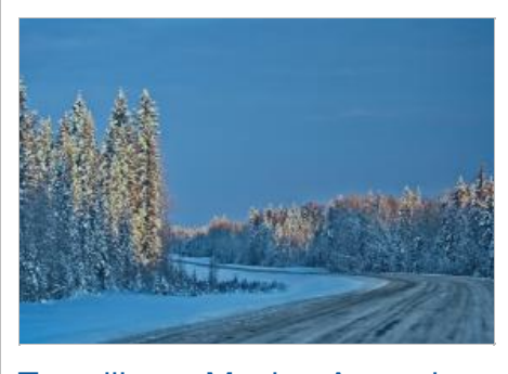
Travelling + Moving Around

Mental and physical health, financial supports, travelling, parenting, caring for others, services and safety for individuals and families.