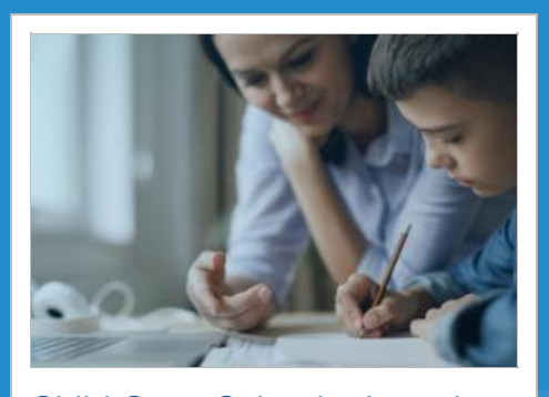
Child Care, School + Learning Early learning, child care, JK-12, and post-secondary information and

border, self-isolation plans, parks, tourism operators, and long-haul trucking information.