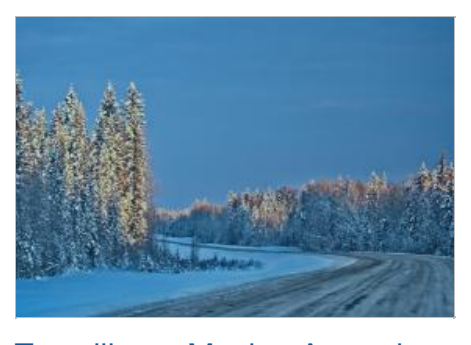
Travelling + Moving Around

Mental and physical health, financial supports, travelling, parenting, caring for others, services and safety for individuals and families.