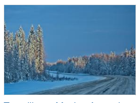
Travelling + Moving Around

Mental and physical health, financial supports, travelling, parenting, caring for others, services and safety for individuals and families.