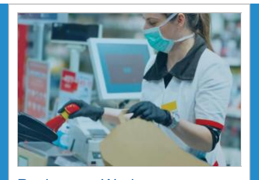
Business + Work Information and resources for

employers, employees, economic relief, essential and high-risk workers in the NWT.