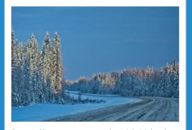
(https://www.gov.nt.ca/covid-19/en/services/travel-moving-around) Travelling + Moving Around (https://www.gov.nt.ca/covid-19/en/services/travel-moving-around) International and domestic travel, NWT border, self-isolation plans (https://www.gov.nt.ca/covid-19/en/services/health-and-well-being/self-isolation-plan), parks, tourism operators, and long-haul trucking information.

Mental and physical health, financial supports, travelling, parenting, caring for others, services and safety for individuals and families.