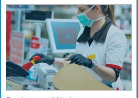
Business + Work Information and resources for employers, employees, economic relief, essential and high-risk workers in the NWT.