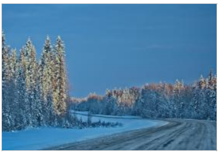
Travelling + Moving Around

Mental and physical health, financial supports, travelling, parenting, caring for others, services and safety for individuals and families.