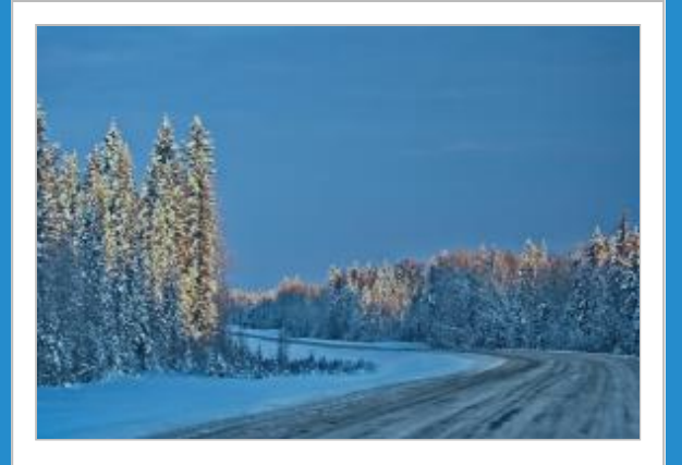
(https://www.gov.nt.ca/covid-19/en/services/travel-moving-around) Travelling + Moving Around (https://www.gov.nt.ca/covid-19/en/services/travel-moving-around) International and domestic travel, NWT border, self-isolation plans (https://www.gov.nt.ca/covid-19/en/services/health-and-well-being/self-isolation-plan), parks, tourism operators, and long-haul trucking information.

Mental and physical health, financial supports, travelling, parenting, caring for others, services and safety for individuals and families.