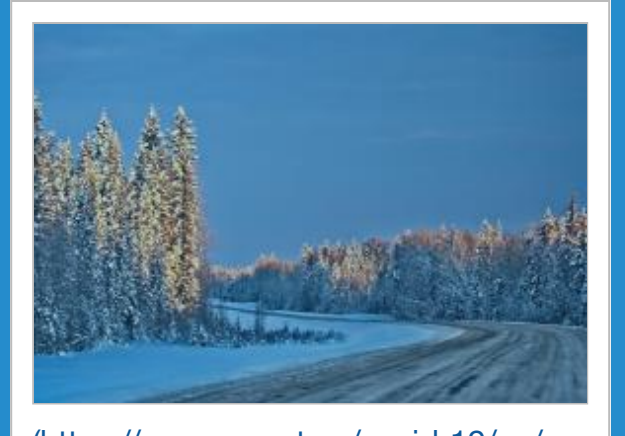
(https://www.gov.nt.ca/covid-19/en/services/travel-moving-around) Travelling + Moving Around (https://www.gov.nt.ca/covid-19/en/services/travel-moving-around) International and domestic travel, NWT border, self-isolation plans (https://www.gov.nt.ca/covid-19/en/services/health-and-well-being/self-isolation-plan), parks, tourism operators, and long-haul trucking information.

Mental and physical health, financial supports, travelling, parenting, caring for others, services and safety for individuals and families.