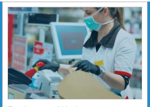
Business + Work

Information and resources for employers, employees, economic relief, essential and high-risk workers in the NWT.