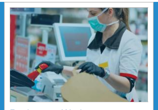
Business + Work Information and resources for employers, employees, economic relief, essential and high-risk workers