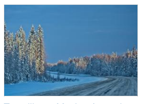
Travelling + Moving Around International and domestic travel, NWT

Mental and physical health, financial supports, travelling, parenting, caring for others, services and safety for individuals and families.