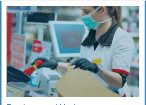
Business + Work Information and resources for employers, employees, economic relief, essential and high-risk workers in the NWT.