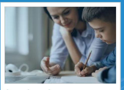
Child Care, School + Learning JK-12 back to school, early learning, child care, and post-secondary information and resources for students, parents, caregivers and teachers.

International and domestic travel, NWT border, <u>self-isolation plans</u>, parks, tourism operators, and long-haul trucking information.