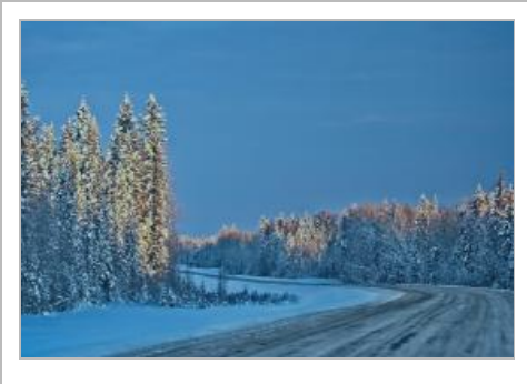
Travelling + Moving Around

Mental and physical health, financial supports, travelling, parenting, caring for others, services and safety for individuals and families.