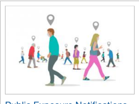
Public Exposure Notifications