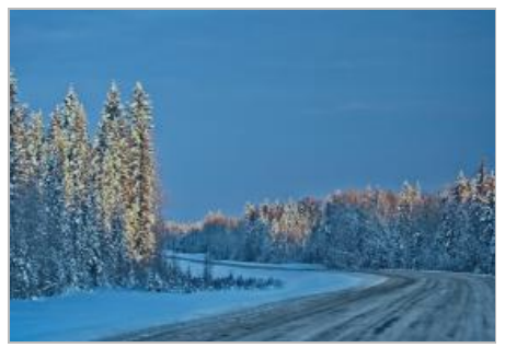
Travelling + Moving Around International and domestic travel, NWT border, self-isolation plans, parks, tourism operators, and long-haul trucking information.