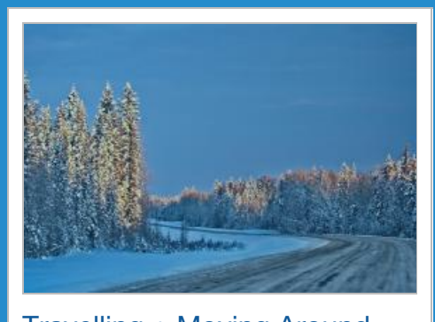
Travelling + Moving Around

Mental and physical health, financial supports, travelling, parenting, caring for others, services and safety for individuals and families.