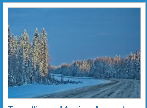
Travelling + Moving Around

Mental and physical health, financial supports, travelling, parenting, caring for others, services and safety for individuals and families.