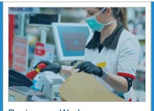
Business + Work Information and resources for employers, employees, economic relief, essential and high-risk workers in the NWT.