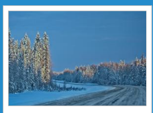
Travelling + Moving Around

Mental and physical health, financial supports, travelling, parenting, caring for others, services and safety for individuals and families.