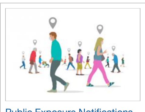
Public Exposure Notifications