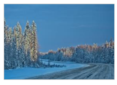
Travelling + Moving Around

Mental and physical health, financial supports, travelling, parenting, caring for others, services and safety for individuals and families.