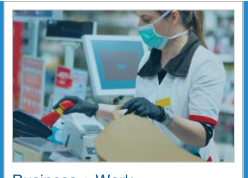
Business + Work Information and resources for employers, employees, economic relief, essential and high-risk workers in the NWT.