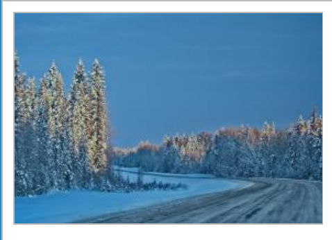
Travelling + Moving Around

Mental and physical health, financial supports, travelling, parenting, caring for others, services and safety for individuals and families.