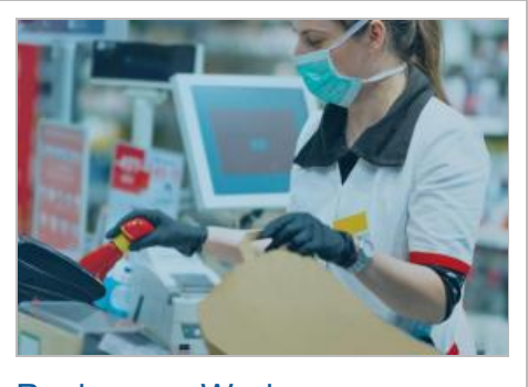
Business + Work Information and resources for

employers, employees, economic relief, essential and high-risk workers in the NWT.