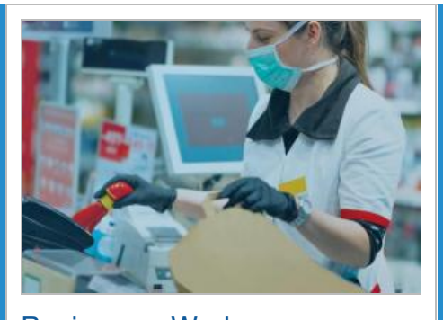
Business + Work Information and resources for employers, employees, economic relief, essential and high-risk workers