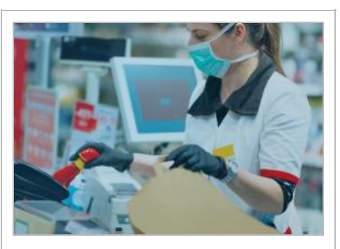
Re-opening your Business