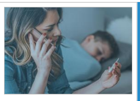
Self-Assessment + Testing

Learn about the symptoms of COVID-19, take the online self-assessment and find out how to get tested in your community.