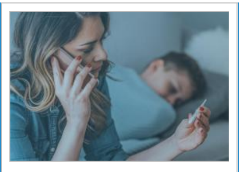
Self-Assessment + Testing

Learn about the symptoms of COVID-19, take the online self-assessment and find out how to get tested in your community.