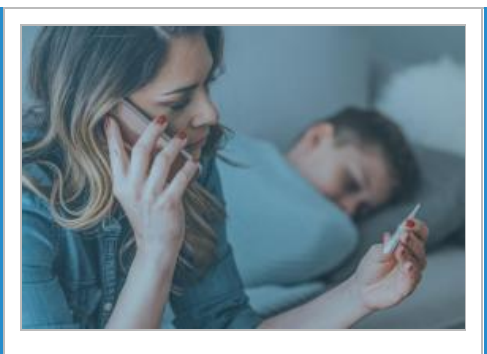
Self-Assessment + Testing

Learn about the symptoms of COVID-19, take the online self-assessment and find out how to get tested in your community.