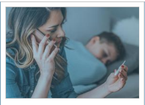
Self-Assessment + Testing

Learn about the symptoms of COVID-19, take the online self-assessment and find out how to get tested in your community.